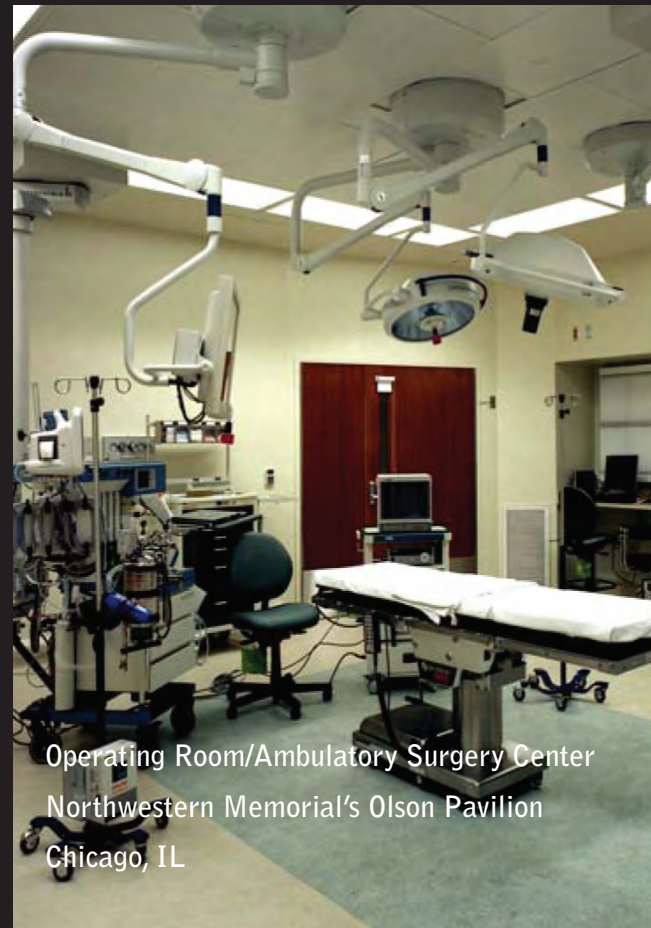
Operating Room/Ambulatory Surgery Center Northwestern Memorial's Olson Pavilion Chicago, IL