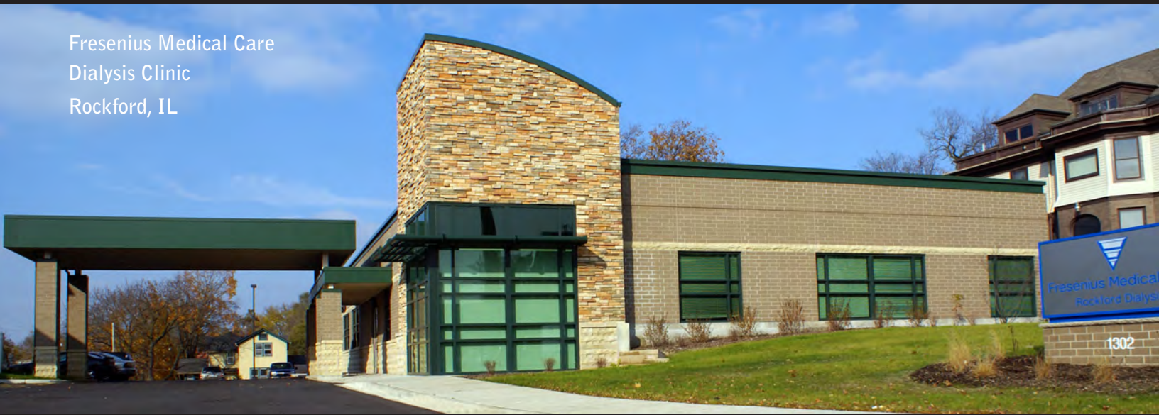
Fresenius Medical Care Dialysis Clinic Rockford, IL