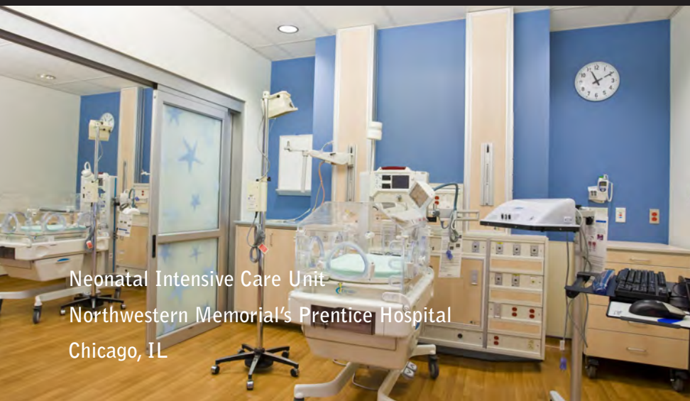
Neonatal Intensive Care Unit Northwestern Memorial's Prentice Hospital Chicago, IL