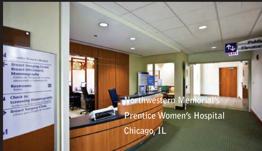
Northwestern Memorial's Prentice Women's Hospital Chicago, IL

...so that we can plan, design, and build or renovate a health care facility that meets your needs, to help you meet the needs of those you serve.