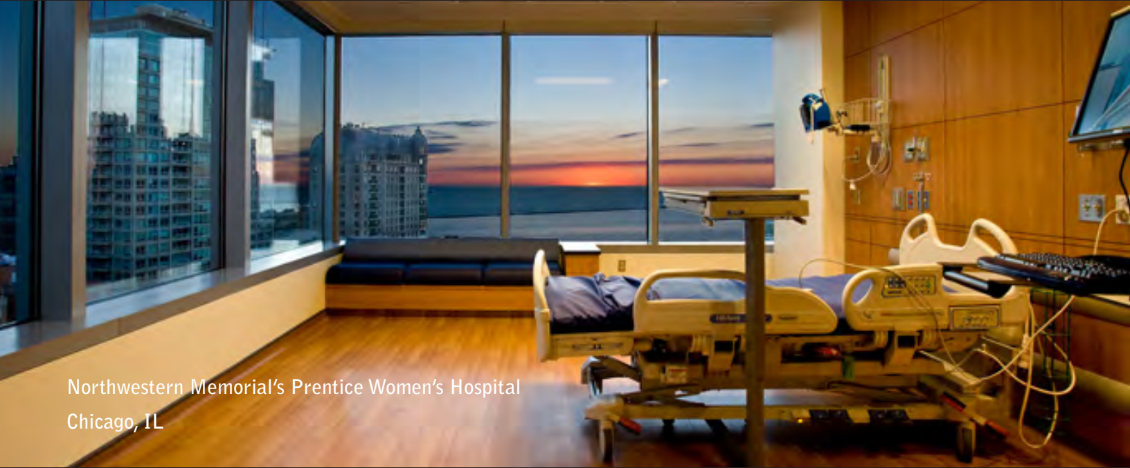
Northwestern Memorial's Prentice Women's Hospital Chicago, IL